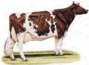
Red & White