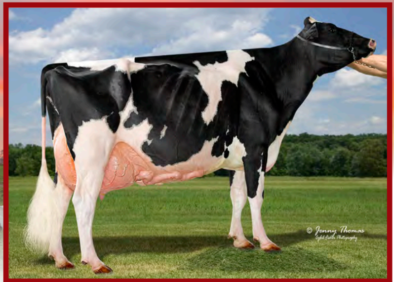
Toppglen Atwood Waki EX-94