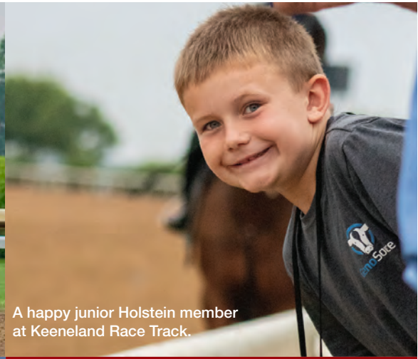
A happy junior Holstein member at Keeneland Race Track.

As you know, for years another breed has tried to use components and efficiency as their calling cards. The Michigan State study clearly answers the components and the efficiency questions of the past.